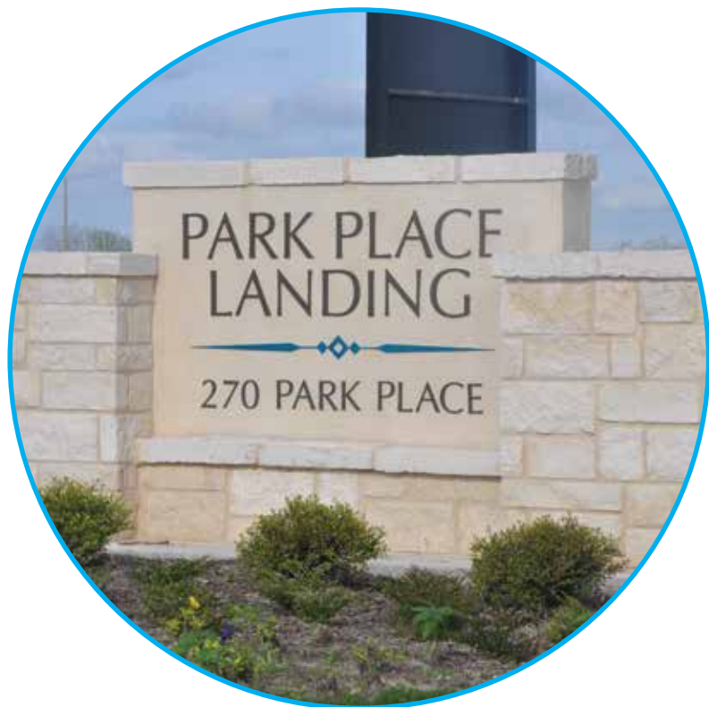
Park Place Landing 270 Park Place Kenedy, TX 78119